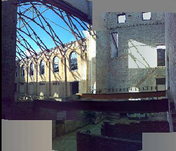
ABOVE & LEFT: The Stage: The finished panorama is shown above, but in this instance I have opted to show the photos which make up the final shot as well, because they collectively show the area under the stage which is not visible in the final shot because the grey areas are trimmed out vertically and any detail beyond these boundaries is cropped. It is interesting to note that the girders of the stage do actually drop to the front of the stage and it is not a trick of the camera.